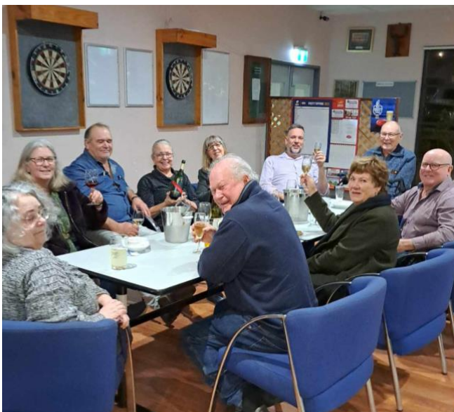
A group of members enjoying the Friday night "Chase the Ace" gathering

For PCSC Club members only, Chase the Ace occurs every Friday from 5-7pm.